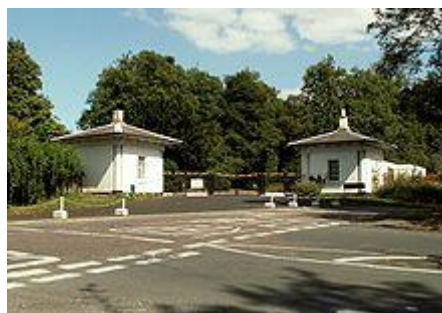
Lodges at the entrance

The pair of lodges at the main gate are Georgian and, in the grounds, there is an out of character 20th century 'Heads House' dating from the use of the NW wing as a school.