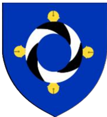
Arms of the Jocelyn family

At some time, the Jocelyn family have held the following titles: Earl Roden; Viscount Jocelyn; Baron Newport; Baron Clanbrassil and Baronet of Hyde Hall. Of these, the titles of Earl Roden and Baronet of Hyde Hall are still extant and in the early 21st century were held in Eire.