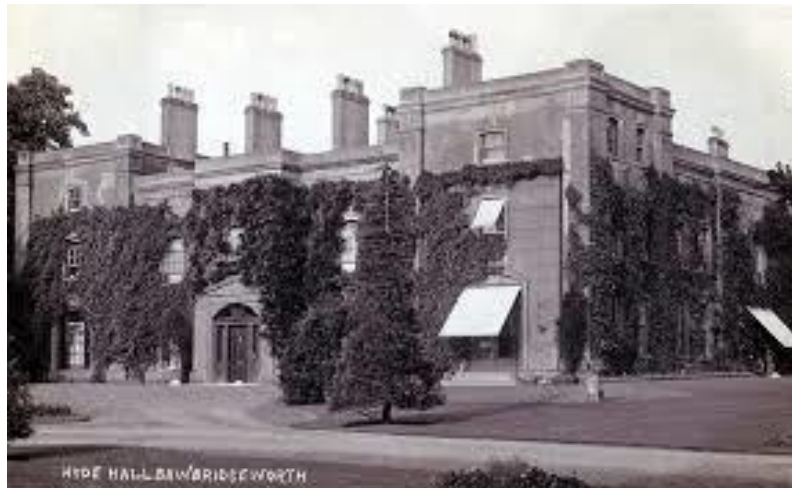
Hyde Hall early 20th century

Following on from the re-modelling, there was a constant series of modifications internally including the transformation of the North West wing into a private school which operated from about 1940 until 1960.