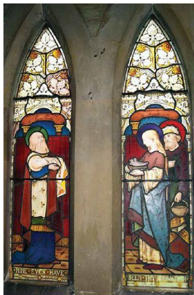
Frederick's Window at St. James's