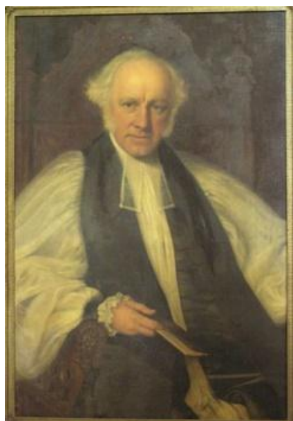
Joseph Cotton Wigram, Bishop of Rochester from 1860 to 1867

Four and a half months later, on Thursday 27 th of June, High Wych Church was consecrated by Joseph Wigram, the recently appointed bishop of Rochester. According to the Herts and Essex Observer of two days later villagers treated the occasion more or less as a holiday. The church was chockablock full. Amongst the congregation were some thirty local clergymen and many other dignitaries. Mostly though, the congregation consisted of new High Wych parishioners. The Observer wrote: "It was gratifying to see with what pleasure and pride the poorer for whose benefit the church is mainly erected, seemed to regard the completion of the work, which had provided for them a beautiful fabric consecrated to the service of God, in which they could assemble for the purpose of prayer and praise of a perfect equality, as well as affording to those who live in its vicinity, greater facilities for attending divine service."